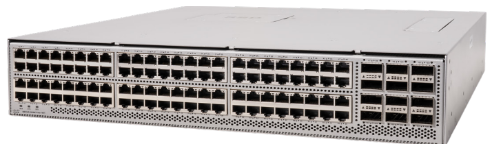
Figure 2. Cisco Nexus 9396T12C -SE1 Switch

The Cisco Nexus 9396T12C-SE1 Switch (Figure 2) is a 2RU switch that supports 4.2 Tbps of bandwidth and over 2.6Bbps. The 96 10GBASE-T downlink ports on the 9396T12C-SE1 can be configured to work as 100-Mbps, 1-Gbps, or 10-Gbps ports. The 12 uplinks ports can be configured as 40- and 100-Gbps ports, offering flexible migration options.