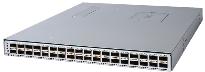
Figure 1. Cisco Nexus 9336C-SE1 Switch

The Cisco Nexus 9336C-SE1 Switch (Figure 1) is a 1RU switch that supports 7.2 Tbps of bandwidth and over 2.6Bbps. The switch can be configured to work as 1/10/25/40/50/100-Gbps offering flexible options in a compact form factor. Breakout is supported on all ports. Please see feature table below for more information.