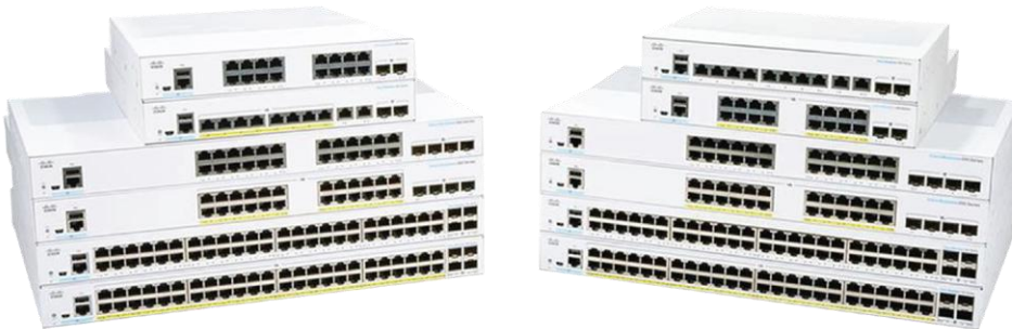
Figure 2. Cisco Business 250 Series switches

The Cisco Business 250 Series is the next generation of affordable switches that combine powerful performance and reliability with a complete suite of the features you need for a solid business network. These switches provide flexible management options, comprehensive security capabilities and Layer 3 static routing features far beyond those of an unmanaged or consumer-grade switch, at a lower cost than for fully managed switches. When you need a reliable solution to share online resources and connect computers, phones, and wireless access points, Cisco Business 250 Series Switches provide the ideal solution at an affordable pricing point.