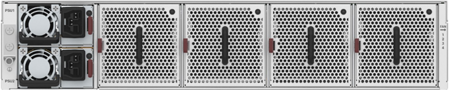
Figure 2. Cisco N9164E-NS4-O switch, backside