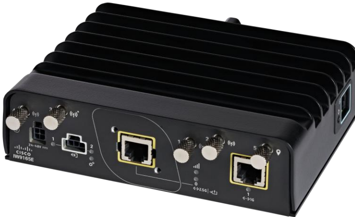
Figure 1. Catalyst IW9165E Rugged Access Point and Wireless Client