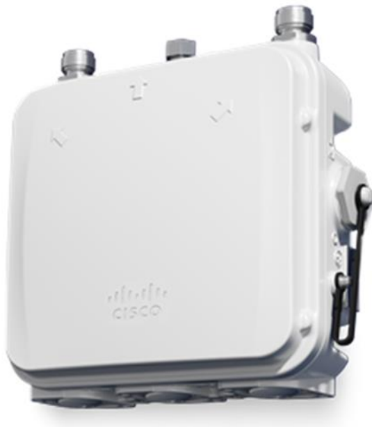
Figure 2. Catalyst IW9165D Heavy Duty Access Point

The Catalyst IW9165D is designed to make wireless backhaul deployment simple. It comes with a built-in directional antenna that enables long-range, high-throughput connectivity anywhere fiber is not an option, so you can create a fixed wireless infrastructure (point-to-point, point-to-multipoint, and mesh) as well as backhaul traffic from mobile devices along wayside or trackside deployments. The external antenna ports let you quickly extend your network to new places when needed and choose the right antenna based on the use cases and deployment architectures. With heavy-duty IP67 design, the Catalyst IW9165D is certified to operate under wet, dusty, and extreme temperature conditions.